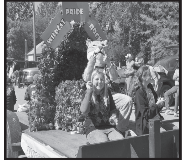
The eighth-grade class throws out candy during the parade.