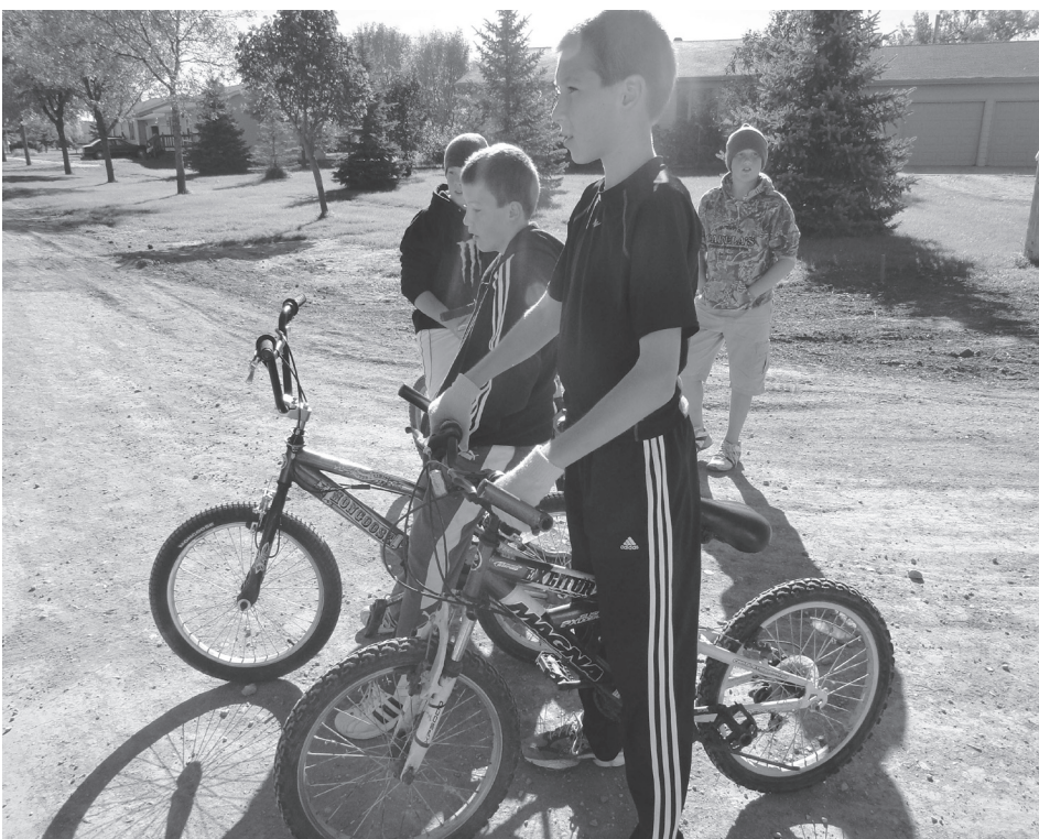
Children participating in the bike race patiently await the start.