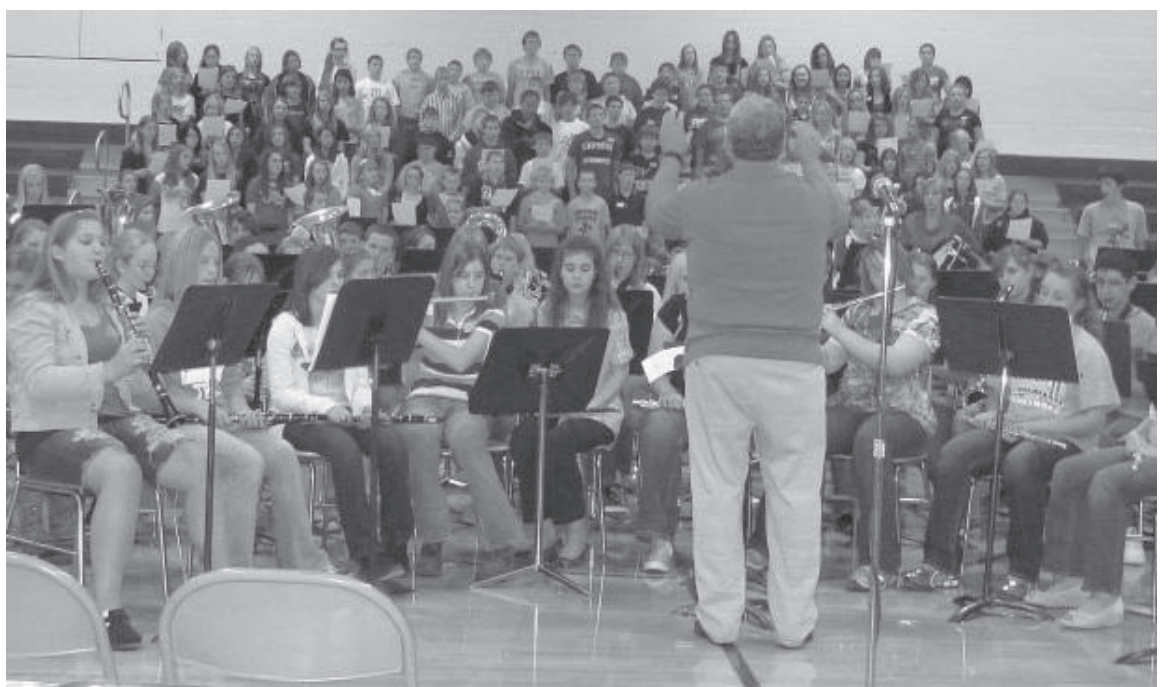
The festival band and chorus performed "God Bless America" together.